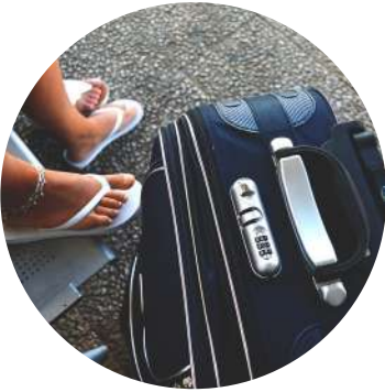
The Ultimate Packing List

Click the images below to be taken to that guide on our website.