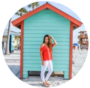
The Ultimate Beach Day on Anna Maria Island