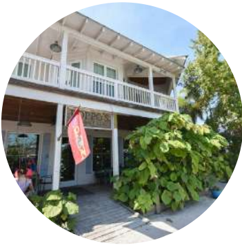
Your Guide to Pine Avenue