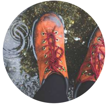
Rainy Day Guide