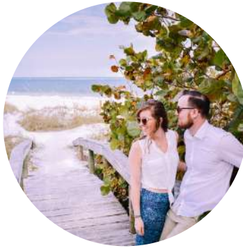
Experience AMI Like a Local