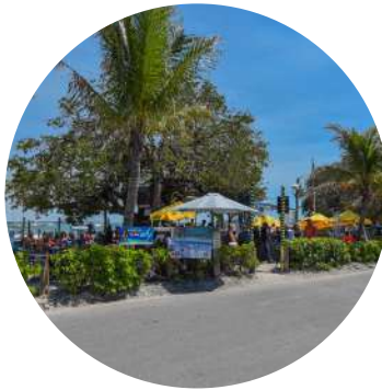
Your Guide to Bridge Street