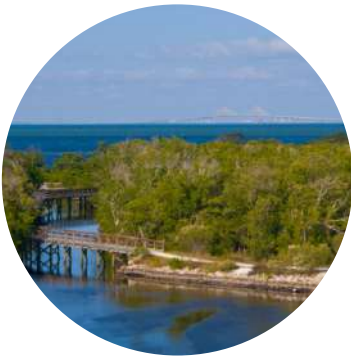
Nature Parks & Wildlife Guide