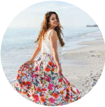
Most Instagrammable Spots