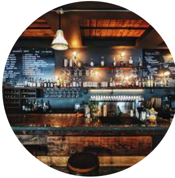
The Ultimate Restaurant Guide