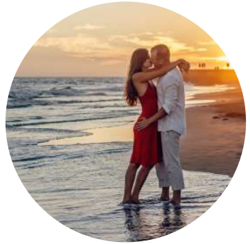
Honeymooning on Anna Maria Island