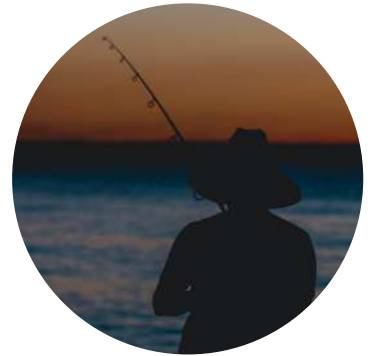
The Best Places to Go Fishing